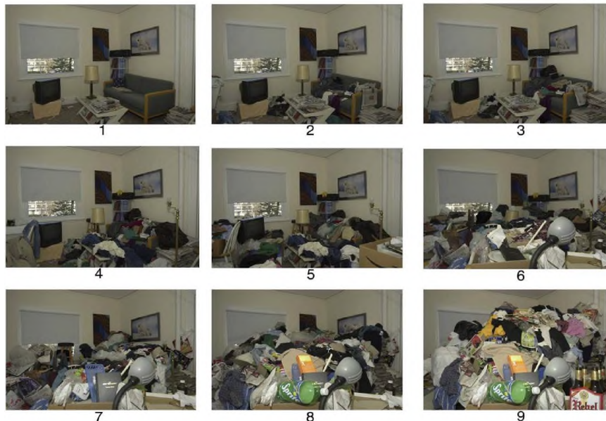
Figure 4. Clutter Image Rating Scale: Living Room, Source: Hoarding Disorders UK ( https://hoardingdisordersuk.org/research-and-resources/clutter-image-ratings/ , 20.05.2020).