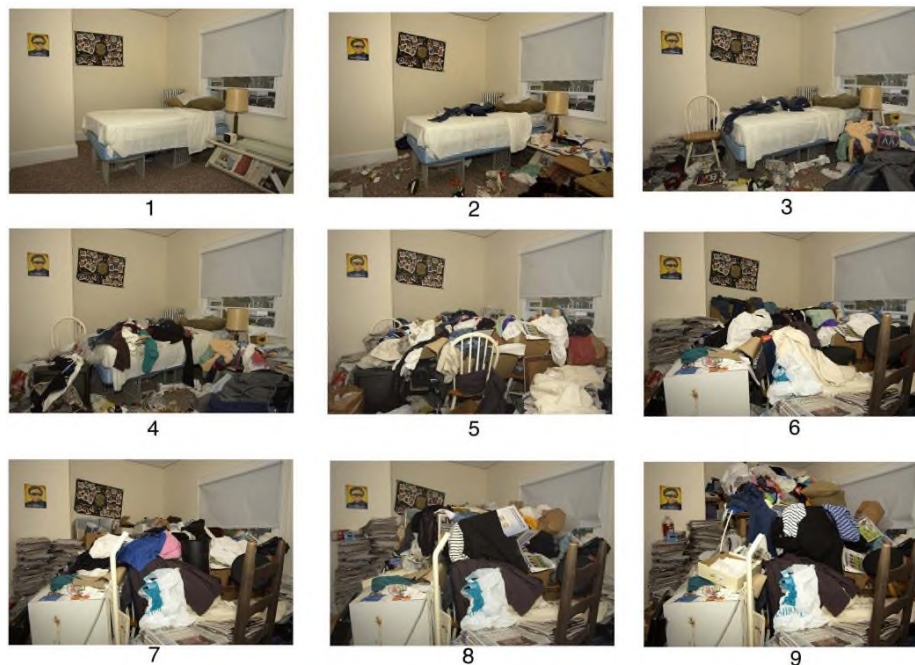
Figure 3. Clutter Image Rating Scale: Bedroom, Source: Hoarding Disorders UK ( https://hoardingdisordersuk.org/research-and-resources/clutter-image-ratings/ , 20.05.2020)